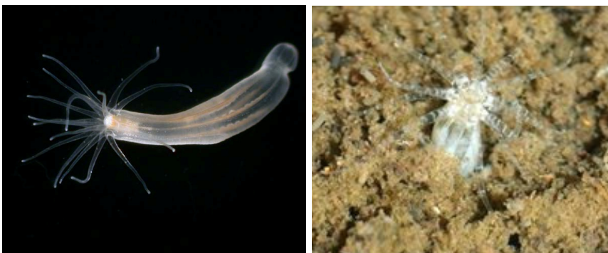
Figure 1. The Starlet Sea Anemone is usually found buried in the soft sediments of saline lagoons where it uses its very sticky tentacles to catch small invertebrate prey.

Owing to its restricted distribution, the Starlet Sea Anemone is classified as Vulnerable on the IUCN Red List and as Rare in Britain. It is also protected under the Wildlife and Countryside Act. Increasing the amount of suitable saline lagoon habitat within the Starlet Sea Anemone's distribution will help to increase the number of healthy populations in England and reduce its overall decline, maintaining UK populations into the future.