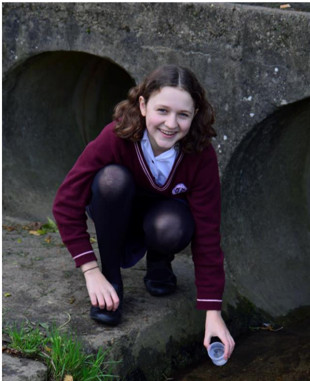
Students can sample from many locations safely if they follow the safety guidelines