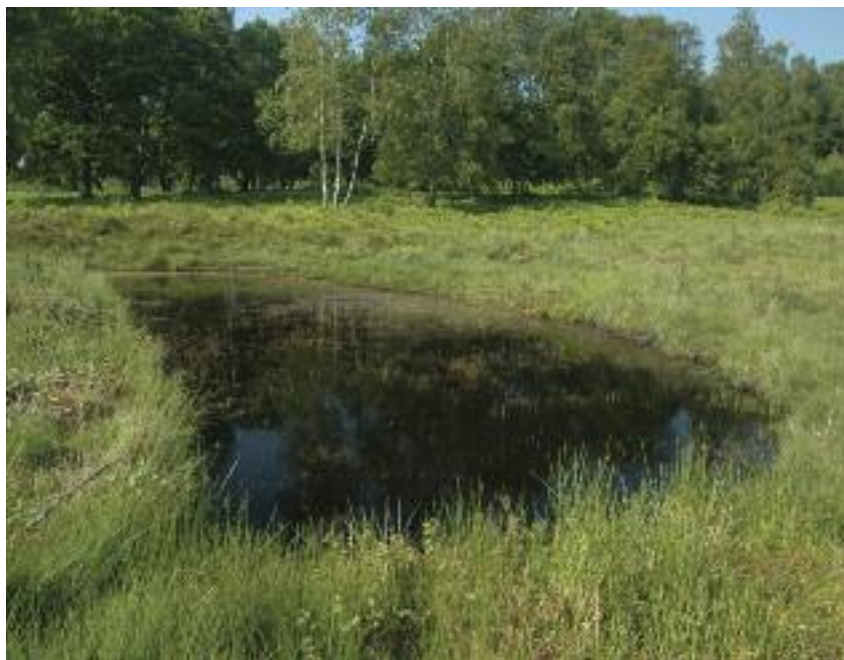
▲ A wooded gravel pit pond near Sutton (Oxon) and a pond on Hothfield Common (Kent).