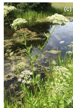
Great Water-parsnip: (a) large umbel of white flowers, (b) characteristic stem leaflets which are lanceolata in shape finely toothed and, (c) Greater Water-parsnip growing along a pond margin in Surrey.